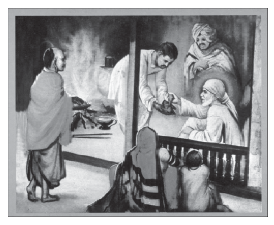
Baba giving Udi in Dwarkamayi